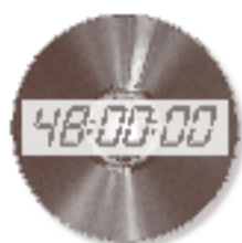
Disney plans to release DVDs with a limited life span.

This holiday season, even more than last year, companies will bombard you with their latest disposable products. Besides disposable pens, lighters, and other throwaways we've grown accustomed to, did you know you can now buy disposable baby bibs, cell phones and even DVDs? That's right. A company called FlexPlay has teamed with General Electric to produce movie discs that self-destruct 48 hours after they are opened. Sound like something only James Bond would use? Thanks to Disney and its Buena Vista Home Entertainment division, "EZ-Ds" have already been successfully test-marketed and will soon hit the stores.