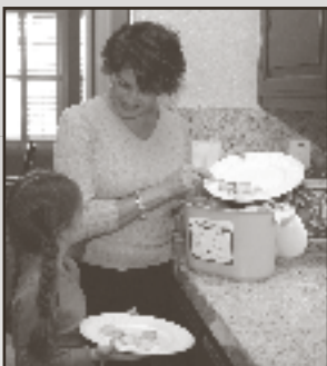
Collecting food scraps is a snap with the new program's kitchen collection containers.

The container fits neatly under the sink or hangs from a cabinet door. You can line the pail with newspaper, paper bags or paper towels to help keep things tidy. Then simply empty the container into your green yard trimmings cart. Combined food and yard trimmings will be picked up weekly on your usual collection day,