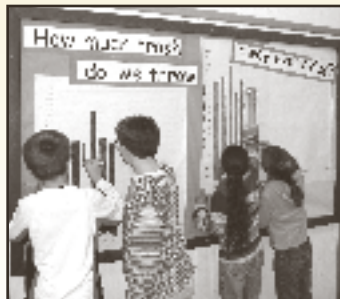
Students at Buena Vista Elementary graph results from a school lunch waste assessment. Buena Vista has been a Wastebuster school for four years.

Walnut Creek Buena Vista Elementary Walnut Heights Elementary