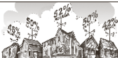
Disappointing News about '05

By participating in this new program, Lamorinda residents will ensure that left-over food scraps are transformed into a nutrient-rich soil amendment used by landscaping companies around the Bay Area.