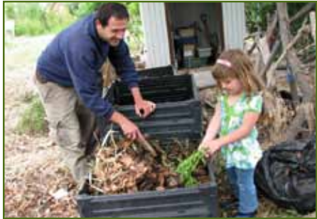
Use fallen leaves for mulching or compost them along with yard trimmings and kitchen scraps.

Mulching in winter protects plants from freezing temperatures at night and maintains dormancy on warm days. In the temperate Bay Area, it also keeps weeds in check. But you don't have to spend a cent on store-bought mulch—not when a natural source is literally growing on (and falling off) trees right outside your door. Fall leaves make great mulching